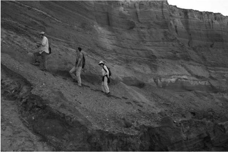
Fig. 3: The Nahal Zeelim gully. The pollen record in the sediments reveals the vegetation history of the Judean highlands in the last five millennia.

lations could have resulted from small climatic changes. The oscillations may also reflect changes in human behavior, such as subsistence practices influenced by economic and social factors rather than climate factors.