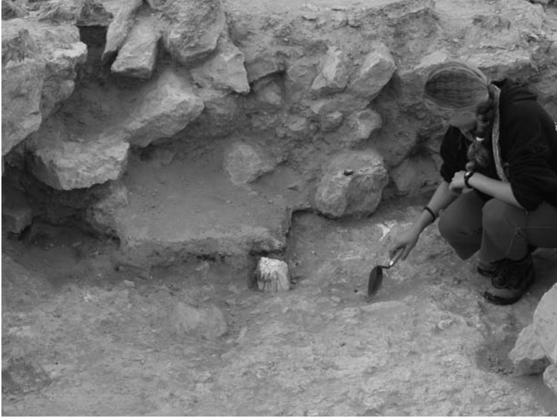
Fig. 4: The Negev Highlands site of Atar Haroa. Extraction of a block with sediments from the floor.

An interesting example of how micro-archaeology may reflect on broad historical questions is provided by studies carried out in Iron IIA Negev Highlands sites by R. Shahack-Gross (geo-archaeology), Boaretto (radio-carbon) and M. Martin (petrography of pottery vessels). These sites (Fig. 4) were described in the past as “Israelite fortresses” from the time of King Solomon that were destroyed in the course of the Sheshonq I campaign to Canaan in the second half of the 10 th century. 20 Other studies proposed sedentarization processes of local pastoral nomads who practiced mixed pastoral activity and seasonal dry-farming. 21 Our sediment investigation in one of these sites indicates that the inhabitants’ subsistence economy was based on animal husbandry, with no evidence for seasonal dry-farming. 22 Radiocarbon dating of short-lived samples from two sites