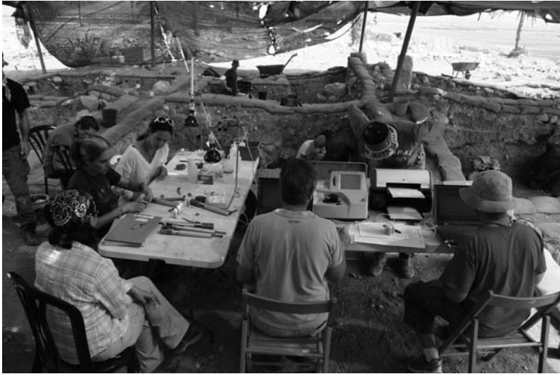
Fig. 1: A laboratory in the field – Megiddo 2010.

In most of the ten tracks the investigations are being conducted with special reference to both the diachronic and synchronic dimensions. This is done by comparing finds in one site/region along the chronology scale and comparing a given assemblage to finds from the same period in other regions.